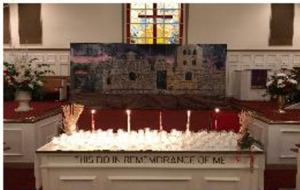
(The prayer table at Saturday, December 23, Longest Night Worship Service)

Maybe you are secretly angry with someone, and you need to confront them, or at least confront your feelings about them. Has someone else been hyper-critical of you? Name it, tell God how that made you feel, and then choose to forgive that person. Forgiveness is the key that sets us free from so many bitter poisons, including a critical spirit dumped on us by others.